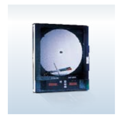
Chart Recorders: for hard copies of all process activities

West Instruments distributes a wide range of Partlow brand digital (microprocessor based) and analogue circular chart recorders. The range provides reliable operation in rugged environments – from light industrial through to extreme industrial wet applications to industry specific flow and relative humidity applications.